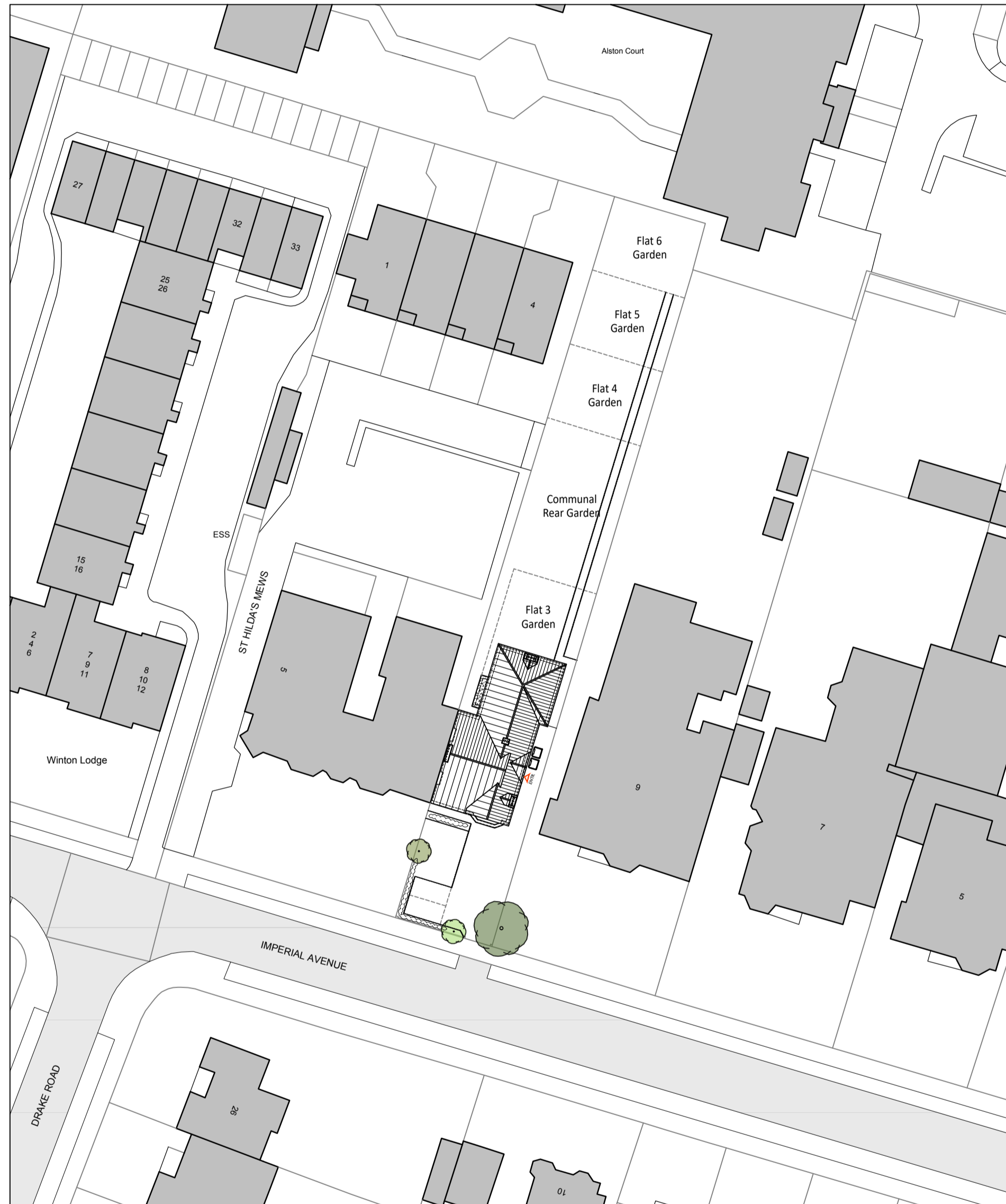
EXISTING BLOCK PLAN SCALE 1:500

General: This drawing is the copyright of More Space Architecture Ltd, which cannot be copied without prior consent. The drawing is to be read in conjunction with all other drawings, schedules and specifications, and all other relevant consultants and/or specialists' information relating to the project. All dimensions are in millimetres unless otherwise stated. Do not scale from this drawing, use figure dimensions only. All levels and dimensions to be checked on site prior to commencement of works. All discrepancies to be relayed back to More Space Architecture Ltd as soon as possible. The contractor is to comply in all respects with the current Building Regulations whether or not specifically stated on these drawings. IMPORTANT NOTE: Works to be fully compliant with the CDM 2015 Regulations.